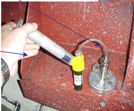
Accurate, clean & reliable method for taking oil samples