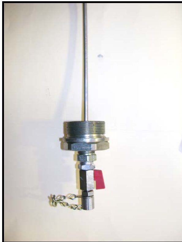
Bung Adaptors for Bottom or Side entry Examples Only