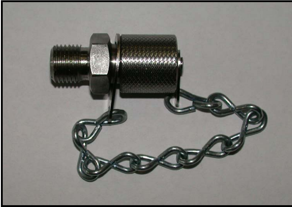
#SP1/4-000 – Sample Point 1/4" BSP x 1/4" Hose w/out SS Tubing