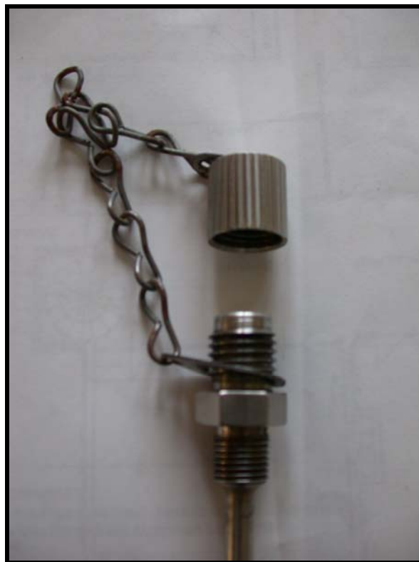
#SP1/4-600 - Sample Point 1/4" BSP x 1/4" Hose w/ 600mm of SS Tubing