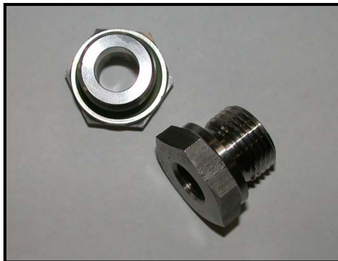
#AD 1/4-1/2B – 1/4" BSPT Female – 1/2" BSPP Male (Screw In)