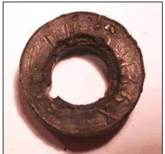
Abrasion of the slide surfaces and lead edge of a Slide Valve Seal from a grease injector.