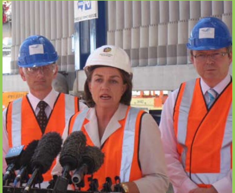
DEPUTY PREMIER ANNA BLIGH & OPPOSITION LEADER KEVIN RUDD ON SITE AT BUNDAMBA FOR ANOTHER MEDIA TOUR