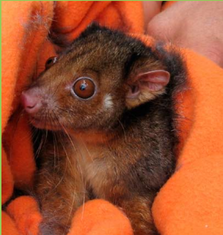
ONE OF THE ANIMALS RESCUED BY THE WILDLIFE WARRIORS AT TRACKSTAR

"What's great about the relationship is that the partnership has opened up real opportunities to make a difference to the way things are done," she said.